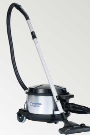
Classic Vacuum cleaner (Nilfisk)

It is important to choose a vacuum cleaner equipped with a HEPA filter, as it can retain even the smallest particles such as pollen and dust mites. A vacuum cleaner with an efficient HEPA filter makes a positive contribution to indoor air quality. The HEPA filter captures 99.99% of all particles from dust, pollen, pet dander, and similar microparticles.