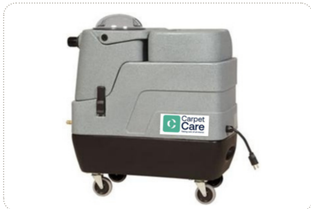
We recommend the carbonation method.

Using the carbonation method, no surfactants or chemical agents are applied that contribute to re-soiling or compromise indoor air quality. The process requires only minimal water usage, preventing saturation of the carpet and thereby minimizing the risk of delamination of the backing material. Additionally, the low moisture level significantly reduces the potential for microbial growth, including bacterial and fungal spores. Typical drying time is approximately 1–2 hours.