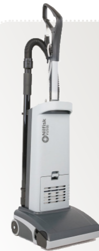
Upright vacuum cleaner with rotating brushes (Nilfisk)

REMEMBER to clean the vacuum nozzle regularly and replace it when needed to ensure effective results.