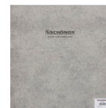
ST FC Sleeve 16.75" x 16.75"