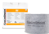
ST Sealing Tape