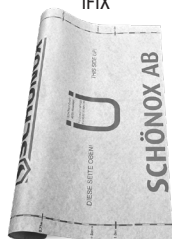
Sealing, Waterproofing Sheet Membrane