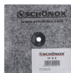
ST D8 Pipe Cover 4.73" x 4.73"w / 5/16" hole diameter