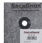
ST D15 Pipe Cover 4.73" x 4.73"w / 5/8" hole diameter