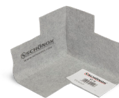
ST IC-Interior Corners