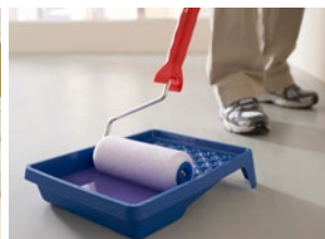
3. Roll on Schönox KH Fix universal primer.