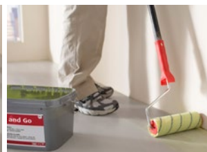
4. Roll on the adhesive.