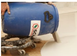
1. Start with a smooth, sound subfloor. Don't have that? Use Schönox AP, synthetic gypsum self-leveling compound, as shown here.