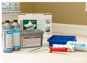
2. Open the fully integrated Roll and Go™ package.